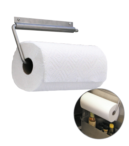
Towel Holder Rack Part#: BBQ08000500

For the ultimate in convenience add this towel holder rack to