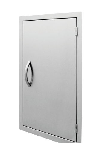
32" Vertical Door Part#: BBQ15832-32

Dimensions: 18"W x 20-1/2"D x 20-3/4"H Cut Out Dimensions: 15-1/4"W x 20-1/4"D x 17-1/4"H